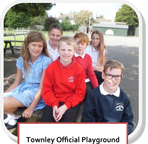
Townley Official Playground Squad 2016-17

If children have a school meal the current price is £2.25 a day. All monies for school dinners should be sent in a clearly named envelope. Cheques should be made payable to Townley Primary School and the name of the child/ren printed clearly on the reverse of the cheque. It is extremely helpful if all dinner money is paid at the start of the week. All children in Key Stage 1 are entitled to a free school dinner.